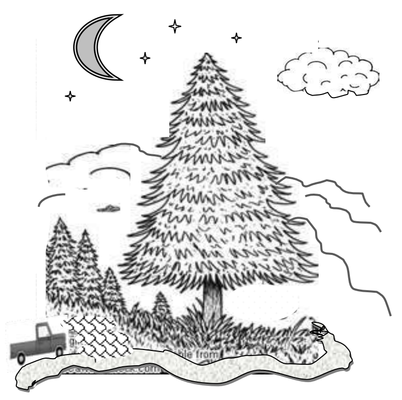
It's Twilight Time Again

Massachusetts Christmas Tree Association www.christmas-trees.org